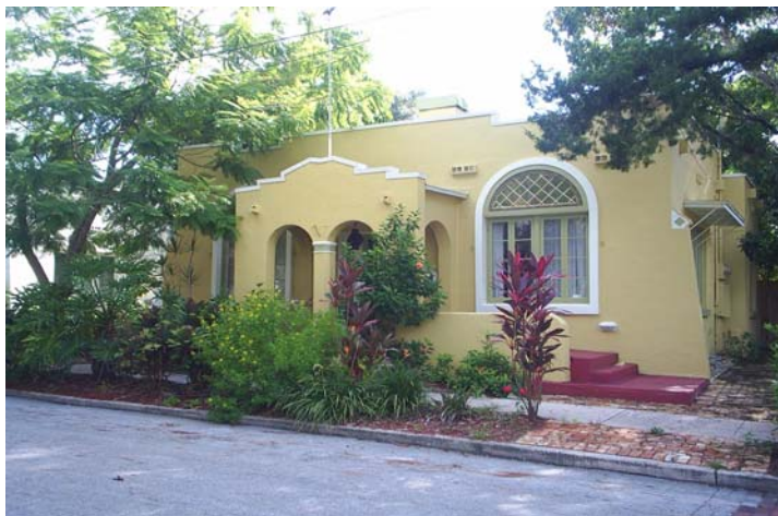
527 Madison C.1925

A national historic district is an honorary distinction. National districts provide no protection and impose no restrictions on owners unless they use federal or state funds to rehabilitate. Districts DO create awareness, educate, and help people appreciate the tremendous values of historic preservation. Laurel Park will be Sarasota's 5th national historic district and will join with 80,000 national historic properties, landmarks and districts across America listed on the National Register of Historic Places.