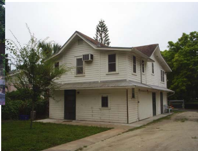
1668 Oak Street (this is the garage)